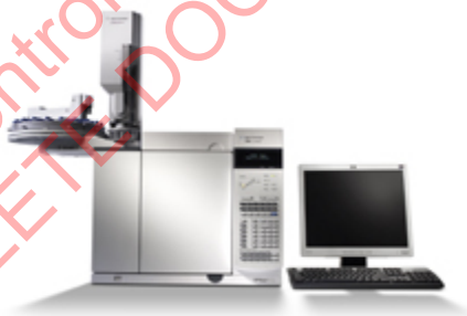
Figure 2. Gas Chromatograph

1.3.1 Agilent 7890A Gas Chromatograph (GC) or equivalent, configured with a Flame Ionization Detector (FID) (Figure 2).